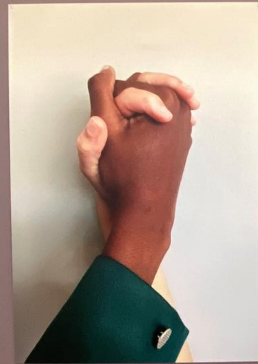
Sammenhengt arbeid Sammenhengt arbeid er viktig for å sikre at alle får samme kvalitet på tjenestene. Dette er en del av kommunens arbeid med å sikre at alle får samme kvalitet på tjenestene.