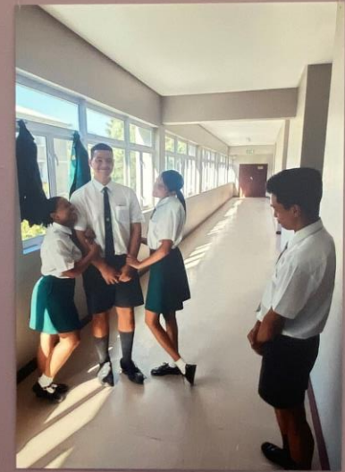
Sammenhengt arbeid Sammenhengt arbeid er viktig for å sikre at alle får samme kvalitet på tjenestene. Dette er en del av kommunens arbeid med å sikre at alle får samme kvalitet på tjenestene.