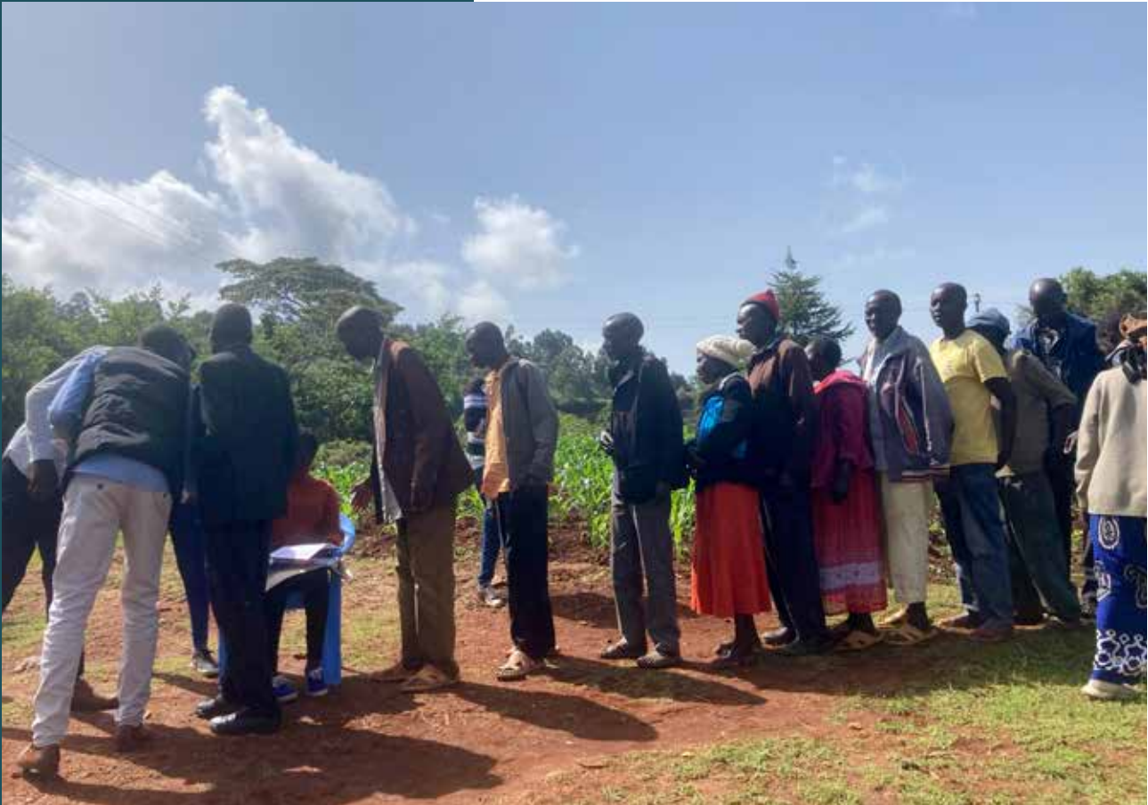
A line of villagers waiting to cast ballots for their preferred project.